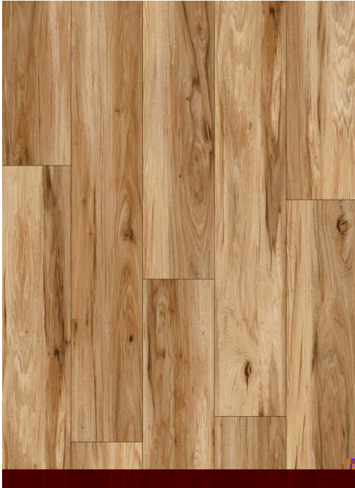
North Way LDTC-6209