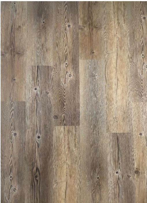
Gulf Haven CFB-GP01