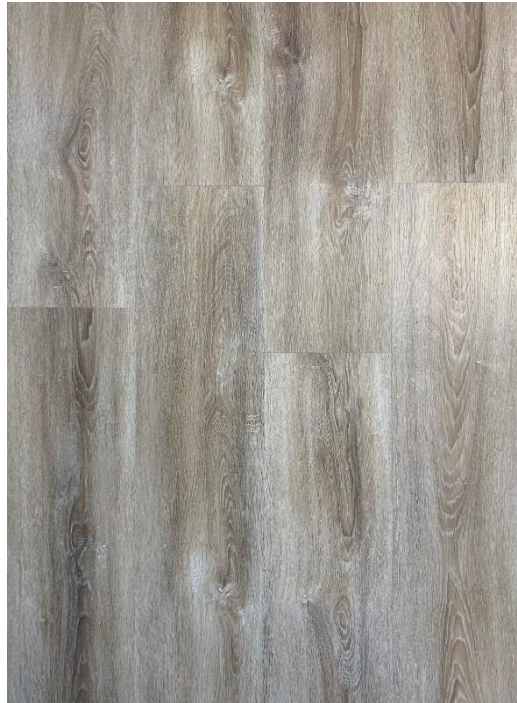
Tower Beach VL 780 CLX